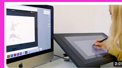
Illustration at Leeds Uni

https://www.youtube.com/watch?v=iXBfHLXPToQ