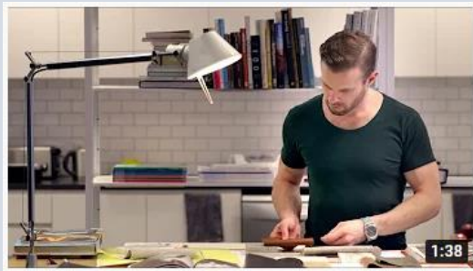
The job of an Interior Designer

https://www.youtube.com/watch?v=AgnNaU0oDXM