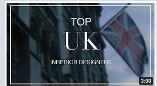
Top 10 Interior Designers

https://www.youtube.com/watch?v=S92Ce4K5oHs