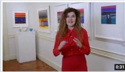
Architect or Interior Designer

https://www.youtube.com/watch?v=oaxQ2bCVCJM