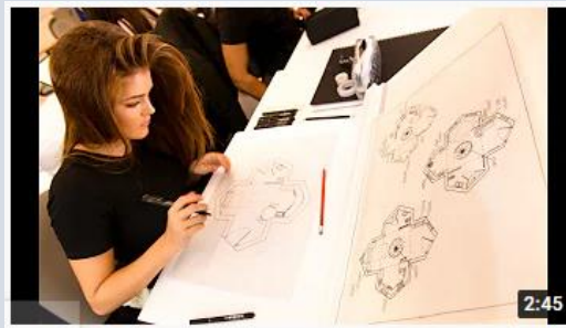
Interior Design at Derby University

https://www.youtube.com/watch?v=Mbv9RQFS5Jk