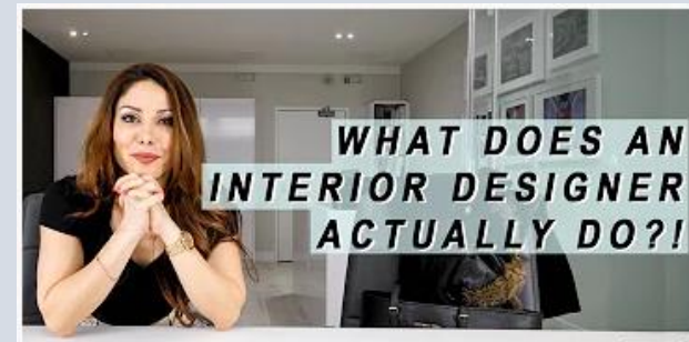
Purpose of an Interior Designer

https://www.youtube.com/watch?v=O0sd20ABH4s