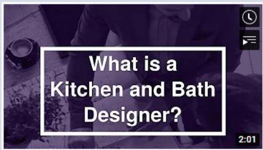
Kitchen and Bathroom Designers

https://www.youtube.com/watch?v=ljFDSEdYQVU