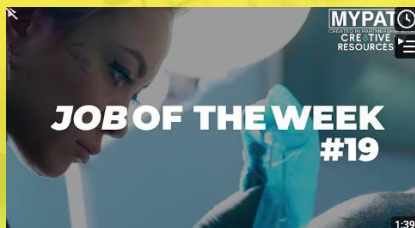
JOB OF THE WEEK - EPISODE #19 - TATTOO ARTIST