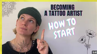
How to become a tattoo artist: where do I start?