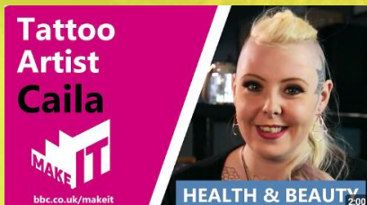
TATTOO ARTIST | Make It Into: Health & Beauty