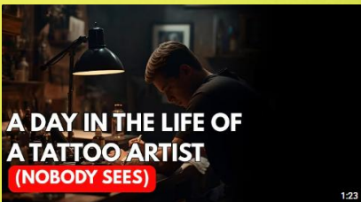
A Day in the Life of a Tattoo Apprentice: The Grind Nobody Sees