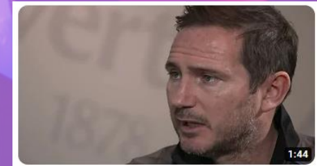
Sports Journalism Course interview Frank Lampard

https://www.youtube.com/watch?v=G1CJ6-63YWU