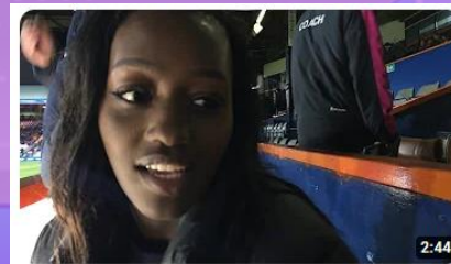
Live assignment for Sports Journalism

https://www.youtube.com/watch?v=5JP8EsBESvA